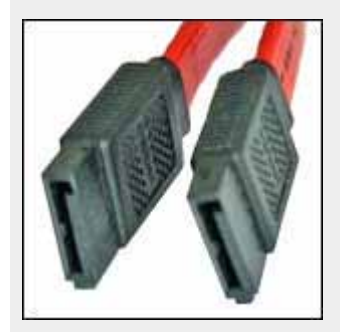
SATA to SATA SATA to SATA internal Hard Drive Cables

Internal SATA hard drive for use with internal connections for SATA drives. 1 meter long.