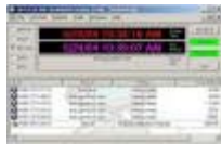
Main Sentry Screen

To synchronize and protect a network see ClockWatch Client/Server .